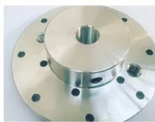
CNC machining undertaken by our team at Challenge Engineering

There are some things you need to get right when deciding how to get metal parts manufactured. How should they be made? Do you go for cast, forged or machined parts?